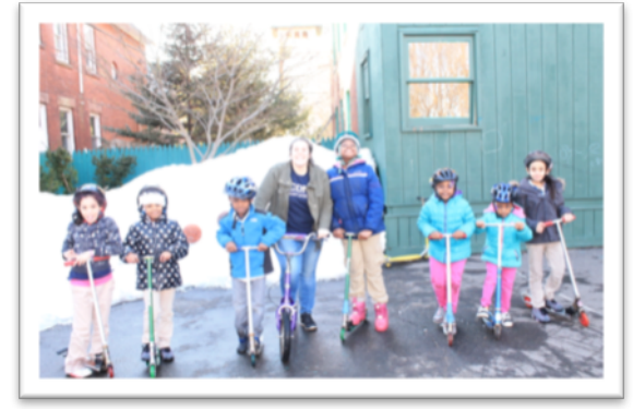
Hartford Catholic Worker