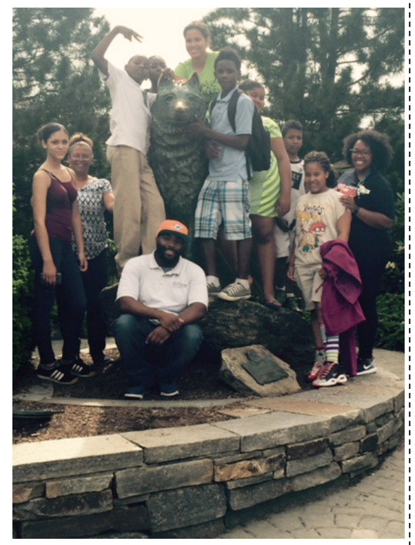
While on the campus tour, students make a quick pit stop to rub the nose of Jonathan the Husky looking to gain "good luck" in their future endeavors!

In June 2015, Husky Sport hosted 22 Hartford youth in grades 5 - 12 at UConn for a College Awareness Trip. Initiated by our Community Renewal Team partner, Husky Sport created an agenda that fulfilled requests to provide students from School After & Weekend the Collaborative with a campus tour and goal setting activity, in addition to including the Husky Sport pillar of physical activity. Broken into three groups, students rotated through 40minute stations that allowed them to experience the University from the Husky Sport perspective. Students were also able to enjoy the unlimited nutritious benefits of the University dining hall.