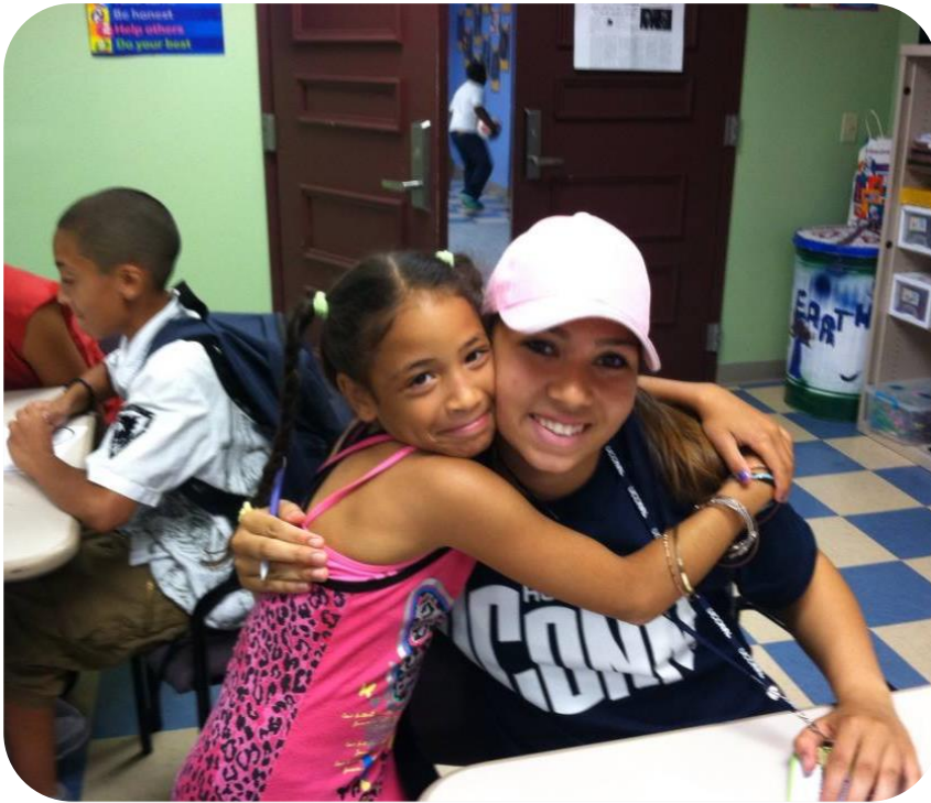
CRT Summer Program!

Collaboration with the Hartford Catholic Worker House and CRT-Generations to offer summer sport, health and wellness programs helped to build bridges between students from 5 to 25 years old. Lots of fun and learning had by all.